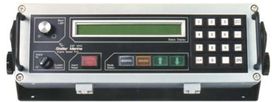
ESP 1000 Electronic Speed Pilot